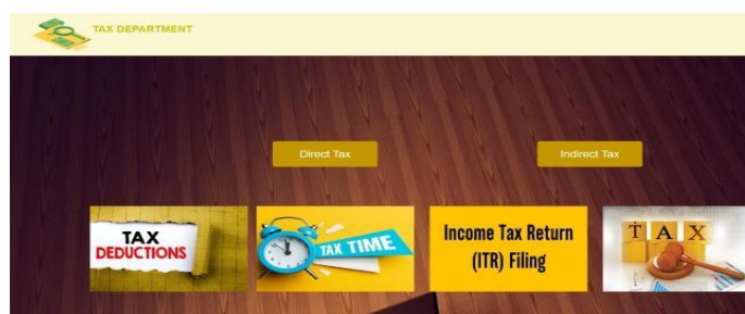
Figure 3: Front End of Blockchain Based Tax System

The hash will be generated for the data and a block is created and that block is stored in the blockchain it will also record when the transaction has taken place by recording the time stamp so by using the technology of blockchain in taxation the problem that has been raised from using a relational database can be conquered like in terms of data security data manipulation and data theft .