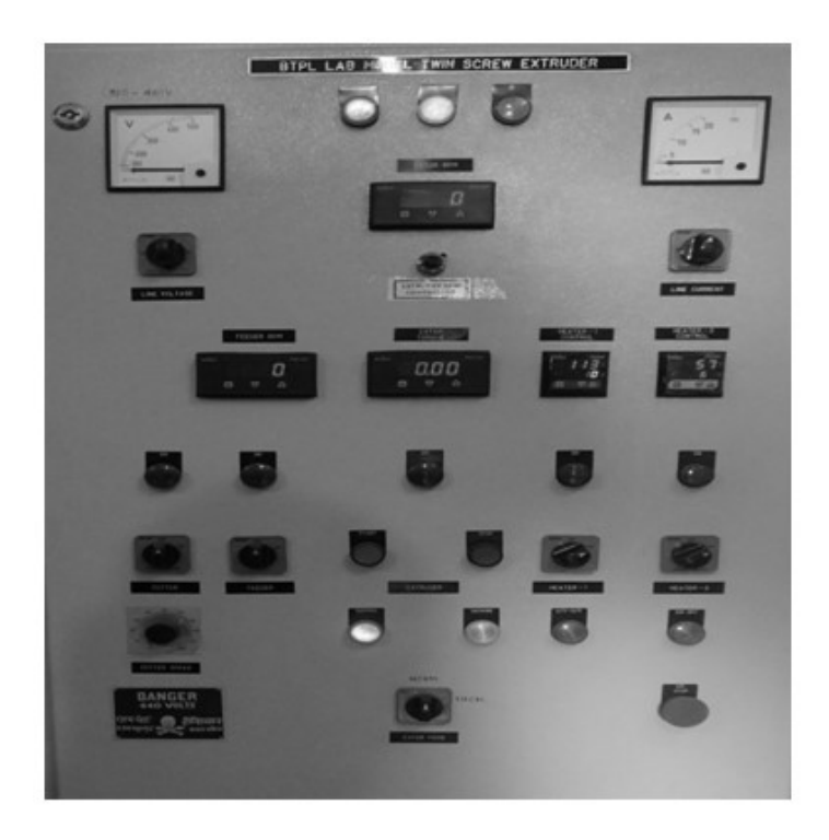
Figure 2: Control panel