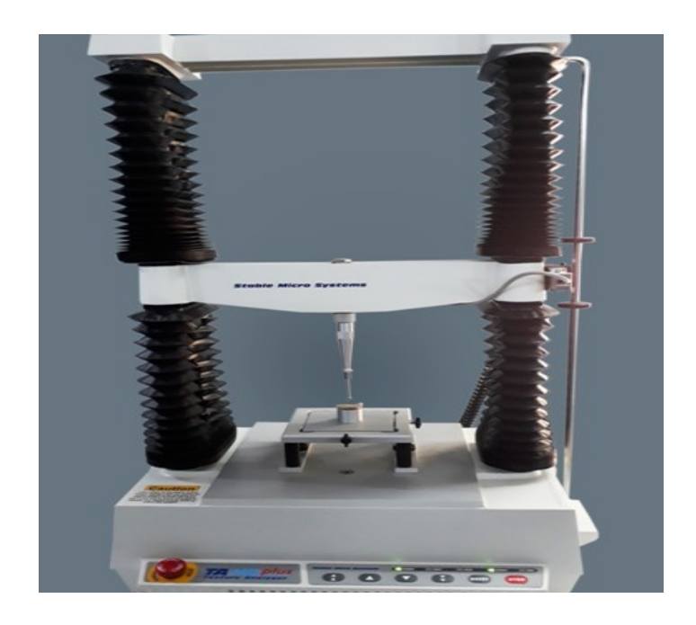
Figure 3: Stable Micro System TA-HD plus Texture Analyzer

• Water absorption index and water solubility index: Determination of water absorption index (WAI) and water solubility index (WSI) of extruded products was done following the procedure described by Ding et al. (2006). The following relationships were used to calculate the values of WAI and WSI.