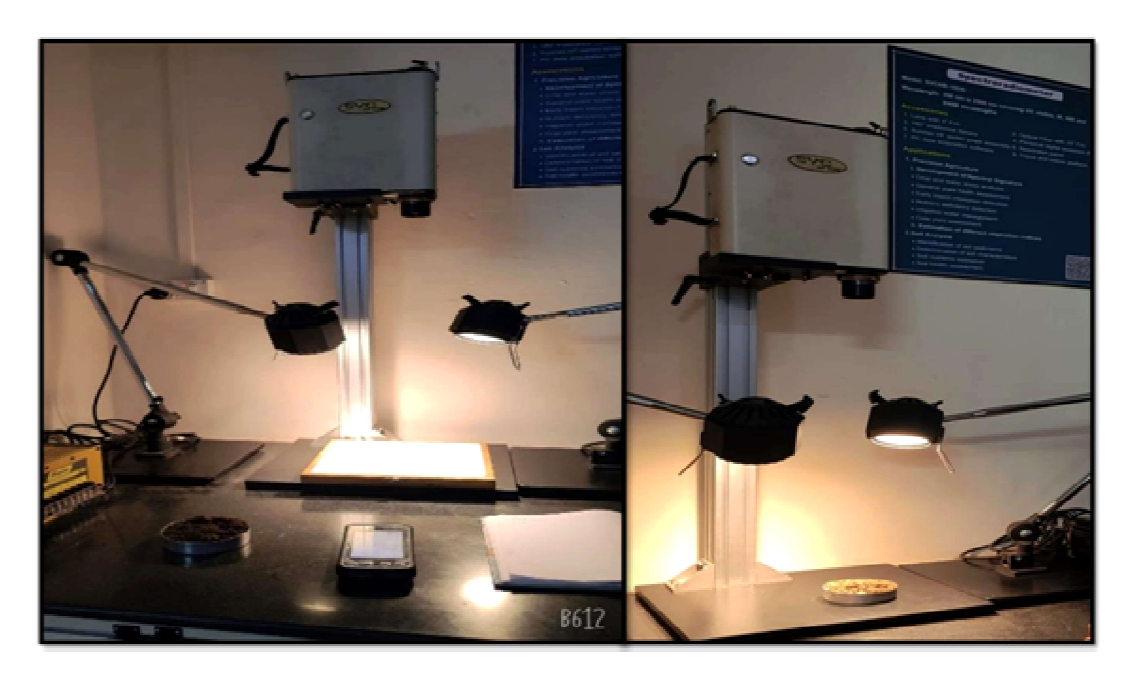
Figure 3: Experimental setup for recording reflectance of soil