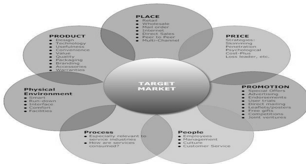
Figure 2: Area of cost reduction