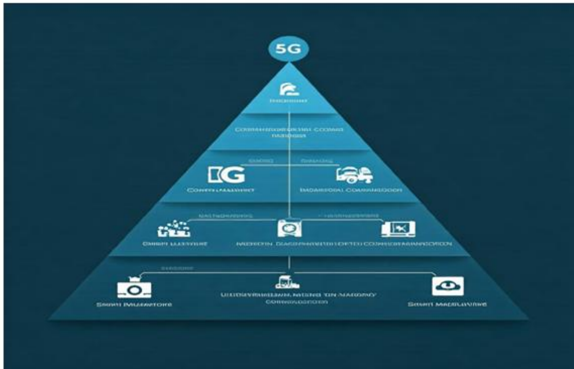
Figure 1: 5G Technology Driving the Digital Transformation