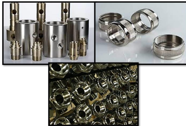
Figure 2. Practical examples of Ni-P coating of steel-based materials

Mahallawy et al. [8] employed the Dell XPS plus electrolytic analytical analysis to further understand particular aspects of Ni-P as they relate to electrostatic compositions in order to determine the process behind the strong durability of electroless-formed Ni-P metals. Studies established the hypothesis that the diffusion-controlled disintegration of the metal was caused by the development of a coating composed of phosphorous at the metal interface. Their layer's phosphorous has the same molecular condition as basic phosphate, according to the results of the XPS/XAES surface examination. Rather, phosphorous was somewhat charged down in the remainder of the mixture and produced through chemical reactions between copper atomic units, which may have affected the arrangement of electrons and increased the inability of Ni-P alloys to dissolve. At the same time, since no nickel oxides were found within the polarized Ni-P alloys, an "oxide kind" passive may be disregarded. Many researchers have succeeded in creating an effective electroless Ni-P-SiC coating method that produces superior corrosion protection on Q235 aluminium [9].