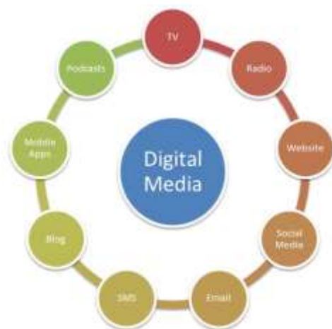
Illustration 1.1

The beginning of virtual Media In in advance instances, messages had been once dispensed by means of one particular supply to their target market. The target audience gathered their sources through a positive form of distribution, whether it become newspapers, magazines, radio, or tv. Publishers had a superb supply of energy over the records allotted and how it become perceived via the general public. But, all that began notably trade with the rise of computer systems and more importantly the net.