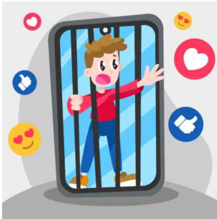
Illustration 1.4

Social disconnect: there is an increasing tendency for people to socialize and speak thru virtual devices in place of via real lifestyles contact. This may easily lead to a feel of disconnect and isolation. Humans have advanced over heaps of years to have actual contact, taking that away is a horrific concept. Studies have suggested that the lack of actual lifestyles touch is causing depression and different forms of mental contamination in many people. Even in a own family, you'll be able to see conversation via digital media, in place of direct conversation. Society maintains to emerge as an increasing number of depersonalized as digitized machines replace humans. Humans shop on-line, do their banking on-line, pay payments on-line, and increasingly more paintings online. Shipping is likewise set to emerge as automated, so that it will bring about taxis and delivery vehicles being motive force free.