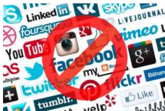
Illustration 1.5

Along with right deeds, a few people are also going in the direction of incorrect activities like cybercrime, spreading dishonorable messages to society, fighting based totally on faith and so forth. Low competencies in digital and e-studying capabilities and the availability of tools pose a assignment. Is social media a dependency? From the beginning of social media, the revolution started to appear as human beings began connecting with the assist of fb or Instagram in place of inquiring for each different numbers. Wherein people used the internet to check emails, wherein human beings used to percentage memorable moments in their lifestyles, commenced using social media to percentage their studies and peep into the lives of others. Instead of wishing on the cellphone on the birthday, wishes are made by way of putting a standing with the picture. There are numerous pals on Facebook, but they're on my own in real life. Social media evokes appearances, because of which horrific characteristics like jealousy, hatred and pleasure flourish in the teens. Social media are simply words, humans hook up with them best with the assist of applications, wherein there is no fact. As a substitute, in real existence, there is no such interplay or communication. A not unusual Indian spends as a minimum two and a 1/2 hours on social media